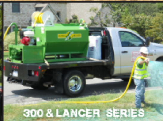
300 & LANCER SERIES