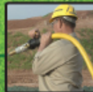
Remote Hose Shut-Off