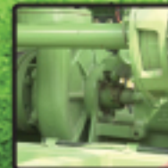
Gear Pump/ Centrifugal Pumps