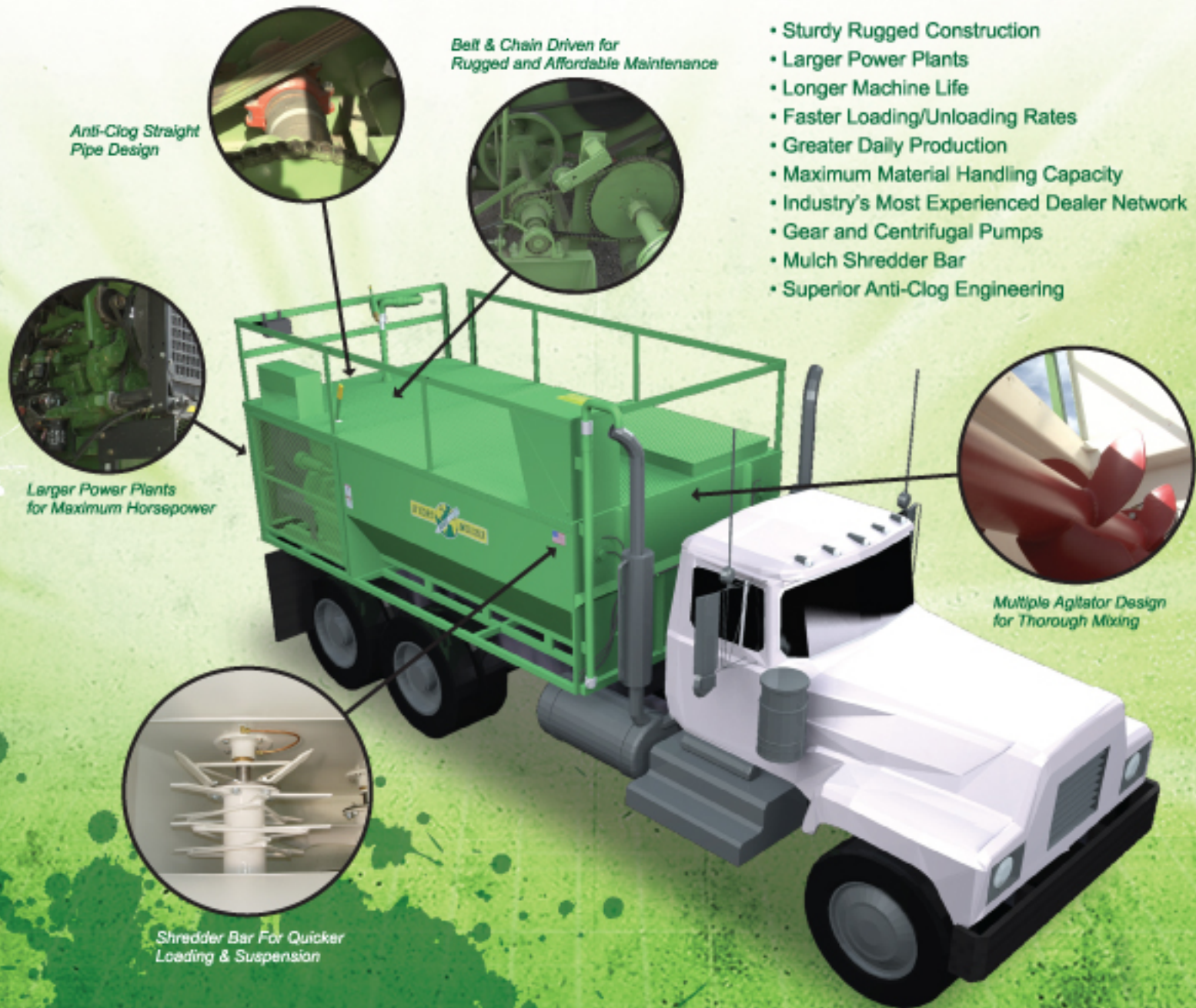
Anti-Clog Straight Pipe Design

Bowie offers a complete line of seeding and mulching equipment. The Bowie Hydro-Mulcher, Landfill-ADCM, Aero-Mulcher and Crimp-Disc are designed for long lasting economical production. Here are some of the features built into every Bowie Hydro-Mulcher.